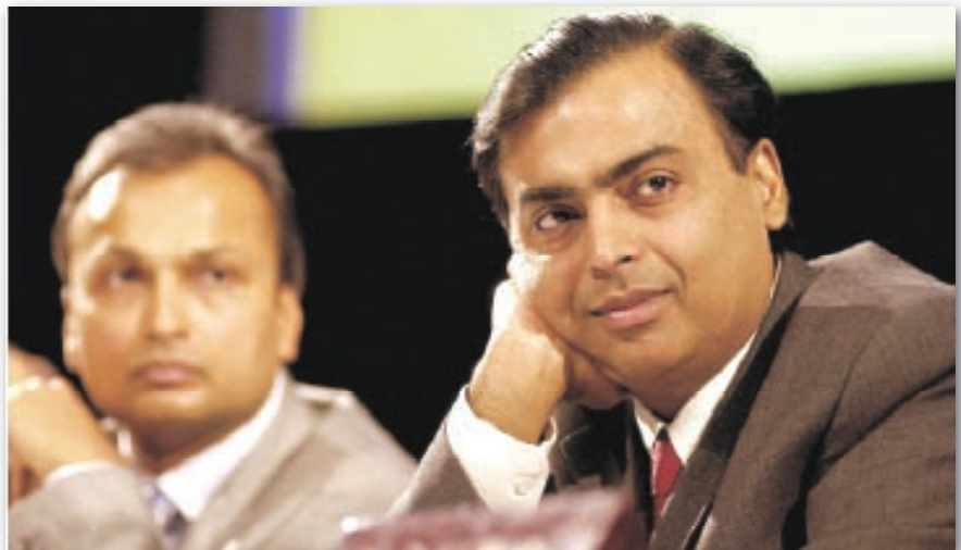
[From Right to Left] Mukesh Ambani and Anil Ambani

As a matter of fact, due to lack of clarity on issues like ownership, freedom and fiscal package and marketing, the global companies are unenthusiastic into the growing Exploration and Production (E&P) sectors in India and Oil and National Gas Corporation (ONGC) is losing out to its partners such as Petrobras, Statoil, and BG, in a various exploration blocks.